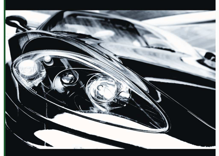
The best storage facility on Boston's North Shore