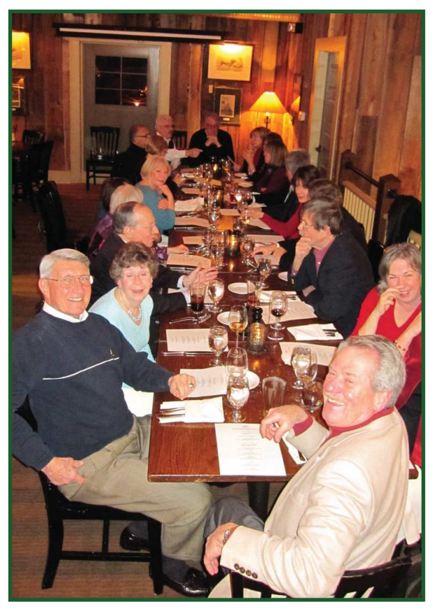
Here's the entire gang at dinner. It was a LONG table!